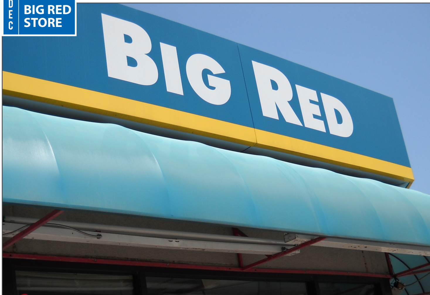
Pictured Above: The Big Red Store in Pine Bluff.